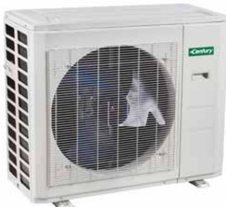
12,000, 18,000, 24,000, 30,000, 36,000 BTUH

1 Oil traps must be installed every 10 feet when outdoor unit is installed above indoor unit.